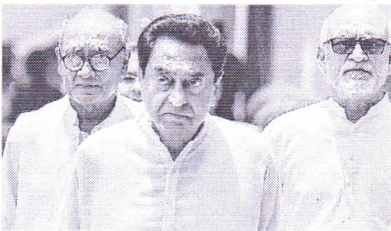
MP Chief Minister Kamal Nath said the government was ready for a floor test

The Bharatiya Janata Party (BJP) in Madhya Pradesh has written to Governor Anandiben Patel, saying the Kamal Nath-led Congress government has lost majority and hence the right to rule the state. This comes a day after the exit polls predicted a thumping victory for the BJP and the National Democratic Alliance in the Lok Sabha elections. In a letter addressed to the governor, leader of opposition Gopal Bhargava wrote that during the six months of the current government, the law and order situation has deteriorated, a drinking water crisis has erupted and farmers are confused. Citing these, Bhargava requested a special session of the Assembly be called. While talking to the media, Bhargava said the Madhya Pradesh government will 'fall on its own'. He said the time has come and it will have to go soon. 'We also want to test the strength of the Congress government,' he added.